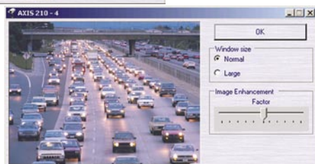
Example of how an image can be improved with AXIS Image Enhancer.